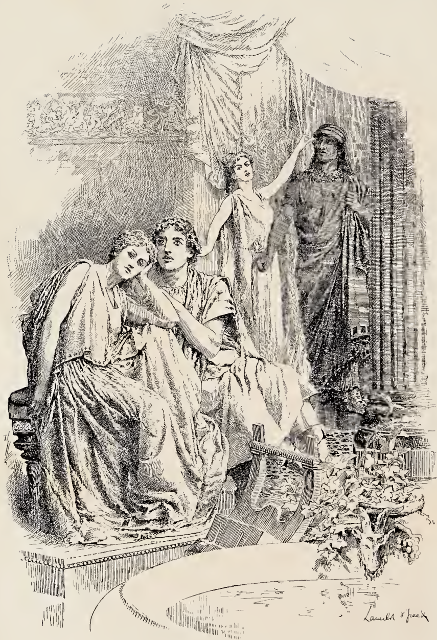
"Arbaces, pausing for a moment, gazed on the pair."—Page 51.